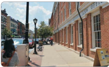
Safe and sound city